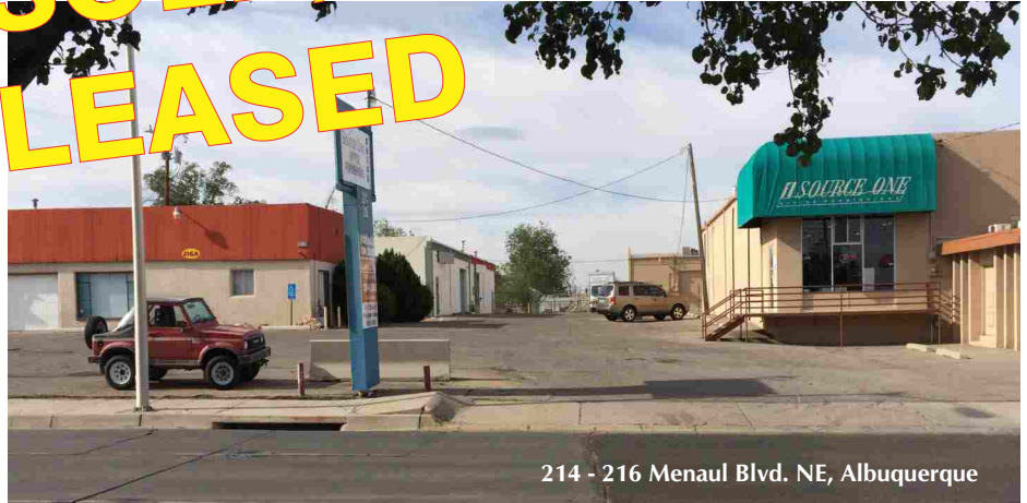
214 - 216 Menaul Blvd. NE, Albuquerque